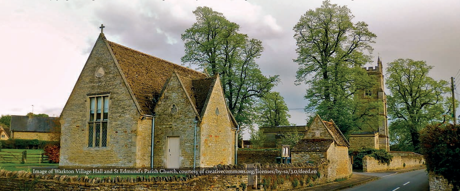
Image of Warkton Village Hall and St Edmund's Parish Church

Our role in the local community is very important to us, from being recognised as a good employer through to sourcing food locally, sponsoring local sports teams and hosting an annual garden party open to the wider community. These aren't just words either as proven by our tasty home cooked food which consistently, year-on-year, achieves a 5* Food Standards Agency Rating, and our Silver Investors in People accreditation, which helps ensure we attract the best nursing and healthcare talent.