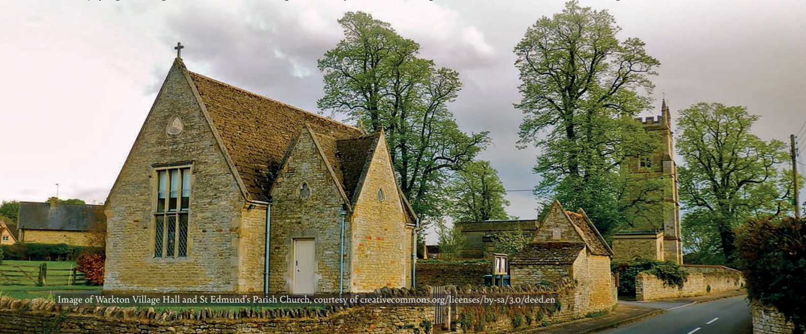
Image of Warkton Village Hall and St Edmund's Parish Church

Our role in the local community is very important to us, from being recognised as a good employer through to sourcing food locally, sponsoring local sports teams and hosting an annual garden party open to the wider community. These aren't just words either as proven by our tasty home cooked food which consistently, year-on-year, achieves a 5* Food Standards Agency Rating, and our Silver Investors in People accreditation, which helps ensure we attract the best nursing and healthcare talent.